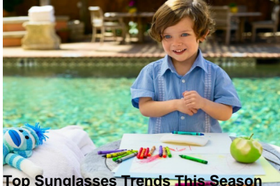
Top Sunglasses Trends This Season

A square faces consists of strong features like a broad forehead, high cheekbones and a square jaw. Opt for oval or rounded frames to reduce the angles and give a softer edge to your look. Cat-eye frames can also work to draw attention to the eyes and create a focal point of the face.