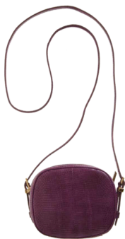
The Row Fuschia/Nut Mini Twin Lizard Messenger. $4,100. BARNEYS NEW YORK HOLIDAY 2012

The Row Fuschia/Nut Mini Twin Lizard Messenger, $4,100