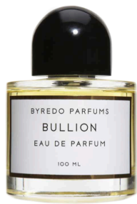
Byredo $225. BARNEYS NEW YORK HOLIDAY 2012

The Row Fuschia/Nut Mini Twin Lizard Messenger, $4,100