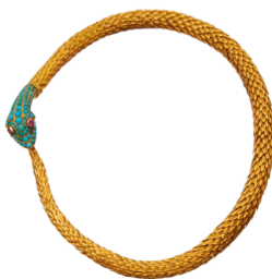
Olivia Collings Antique Jewelry © 2012 18ct Gold Turquoise Serpent Design Necklace $32,015