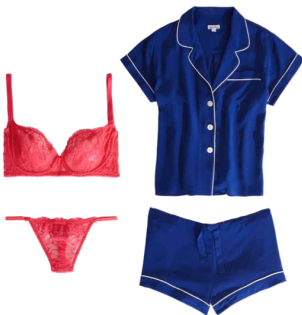
Deborah Marquit Fluorescent French Pink Lace Demi Underwire Bra. $235. Fluorescent French Pink Lace Panty. $75. Steven Alan Cobalt Pajama Top with Ivory Trim. $195. Cobalt Pajama Short with Ivory Trim. $135. BARNEYS NEW YORK HOLIDAY 2012

Deborah Marquit Fluorescent French Pink Lace Demi, $235, Fluorescent Pink French Lace Panty, $75; Steven Alan Cobalt Pajama Top with Ivory Trim, $195, Cobalt Pajama Short with Ivory Trim $135