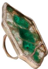
Monique Pean Atelier Emerald Slice Piccu Ring with White Diamond Pave 18K White Gold 1.17 TCW © 2012