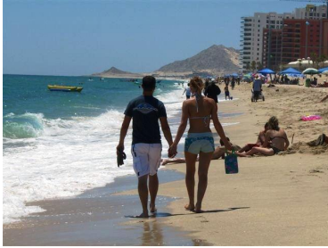
A couple walks on Sandy Beach, while families around them enjoy themselves too.

Sandy Beach is a prime real estate property in Puerto Penasco, “Rocky Point” offering exhilarating views of the beautiful Sea of Cortez and blissful beachcombing right outside your condominium.