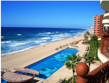
A view of Puerta Privada's pool and view of the ocean.

The investment opportunities in the condominium developments are exceptional today in our turning market.