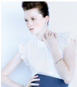
Rebecca Taylor cream and gray dress, $375. Saks Fifth Avenue. Fusion Collection Palladium and 18-karat rose-gold pearl bangle bracelet, $4,900. Palladium and 18-karat yellow-gold pearl ring, $4,600. 14-karat white-gold diamond hoop earrings, $2,530. Paragon Pave Collection 18-karat white-gold diamond bangle bracelets, $4,200-$12,900. 18-karat gold diamond ring, $3,550-$7,700. Coffin & Trout Fine Jewelers.