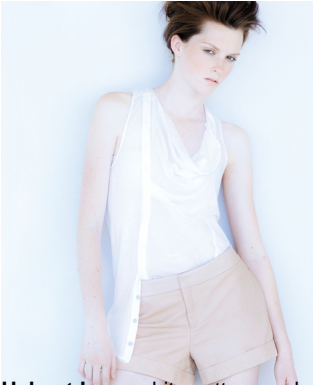
Helmut Lang white cotton cowl-neck tank, $230. The Row camel-colored cuffed leather shorts, $1,100. Barneys New York.

Monday, 28 June 2010 11:09 - Last Updated Tuesday, 29 June 2010 09:38