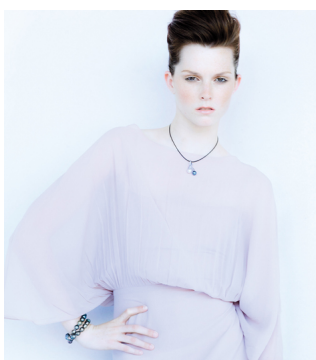
The Row blush-colored chiffon and silk dress, $2,200. Barneys New York. Tahitian pearl strand (worn as bracelet), $1,500. Fusion Collection Palladium pearl pendant (on black rubber cord), $2,600. Coffin & Trout Fine Jewelers.