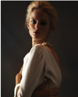
Oday Shakar ivory silk and wool brocade dress, $2,195. www.odayshakar.com .