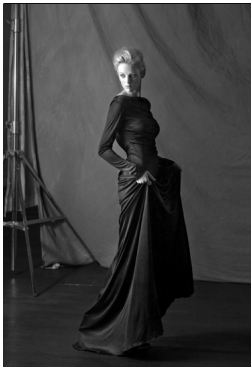
Oday Shakar navy silk jersey gown with deep-plunging back, $2,995. www.odayshakar.com .