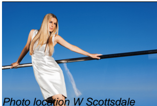
Photo location W Scottsdale

Jill Sander cobalt blue dress with ruched mock turtleneck, $745. Dominique Auriens gold earrings with crystals, $525. Both Neiman Marcus, Scottsdale Fashion Square.